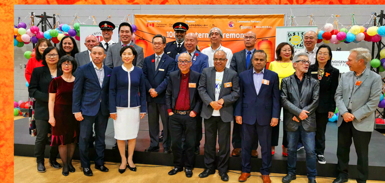
CCC Stronger Together members

The 1000 Lantern Ceremony symbolizes our solidarity with the Indigenous community and our intention to build awareness and strive towards reconciliation.