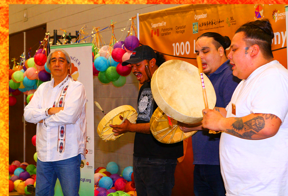
Opening Indigenous ceremony